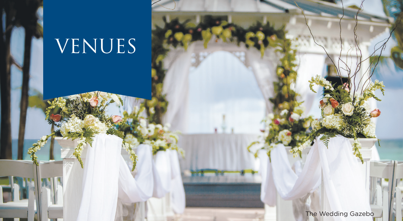
The Wedding Gazebo